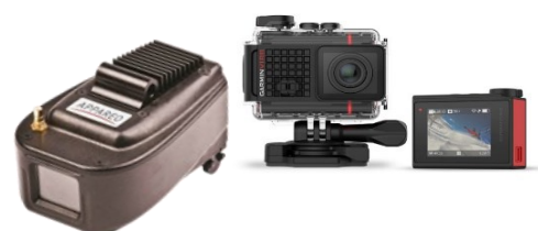
Figure 1: FDM

Large aeroplanes such as airliners are usually obliged to be equipped with flight-data recorders (FDR) and cockpit voice recorders (CVR). Data obtained from these devices (hereinafter referred to as “flight recorders”) is utilized in accident investigations. However, since small aircraft are not obliged to be equipped with flight recorders except those used for air transport services, not many of them are equipped with them. On the other hand, a flight data monitoring device capable of recording