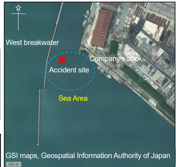
State of the Sea Area

3 anglers who sit on coolers, etc. on the forward deck were thrown into the air due to pitching of the Vessel’s body and fell to the deck. They felt pain in the low back.