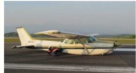
Aircraft involved in the accident