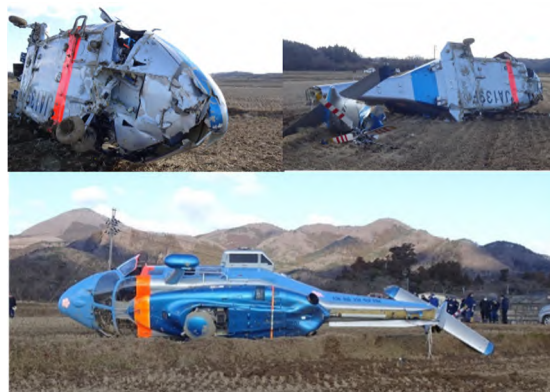
Rollover of the Accident Helicopter Agusta AW139 of the Fukushima Prefectural Police Aviation Unit

Completed investigation reports into 14 aircraft accidents and 7 serious aircraft incidents, we have been reported to the Minister and have been published investigation reports.