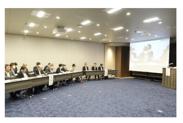
During the event