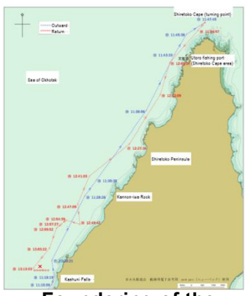
Foundering of the passenger ship KAZU I

(Please refer to Chapter 2, "Summary of recommendations and opinions" on pages 20-21.)