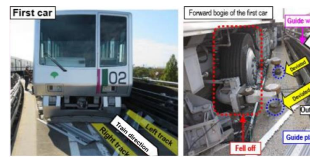
Nippori-Toneri Liner train derailment