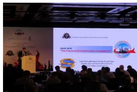
ISASI Annual Seminar (UAE)

ISASI holds annual seminar each year, and Japan has participated in each one of them since the establishment of Japan Aircraft Accident Investigation Commission in 1974. In this seminar, working groups including the Flight Recorder Working Group, the Investigator Training and Education Working Group, the Cabin Safety Working Group, and the Government Air Safety Investigators Group are held in parallel with the general meeting. Japan also participates in these working groups to contribute to technical improvements in these areas.