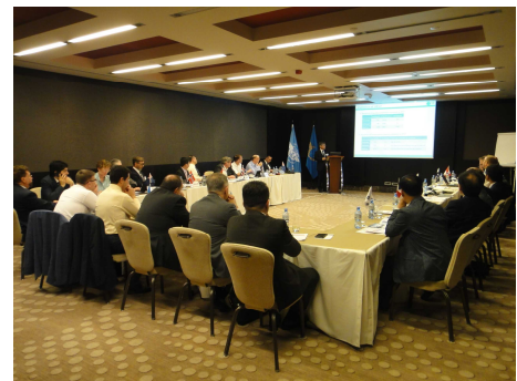
ITSA 2018 Meeting of the Chairpersons (Azerbaijan)

The International Transportation Safety Association (ITSA) was established by accident investigation boards from the Netherlands, the United States, Canada, and Sweden in 1993. As of March 2019, the international organization has members from the transport accident