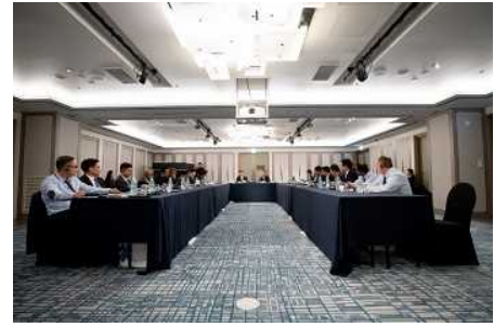
MAIFA21 (the Republic of Korea)

Asia region and to assist developing countries in enhancing their investigation systems. Since 1998, meetings have been held annually, and Japan has been playing a leading role in this forum, including the sponsorship of the 13th meeting in Tokyo in 2010. The network of investigators that has been established through the forum is now effective in its promotion of rapid and smooth international cooperation in accident and incident investigations. Encouraged by the success of MAIFA, E-MAIIF was established in Europe in 2005. A-MAIF was then established in North, Central and South Americas in 2009. These trends contribute more than ever in furthering the exchange and cooperation between marine accident investigators in each region. In the Asia region, there are not only a lot of straits with sea traffic congestion, but also severe weather and hydrographic phenomena that often give rise to tragic marine accidents. Nonetheless, some countries have insufficient capacities or systems for accident investigations. This situation makes these regional fora very important.