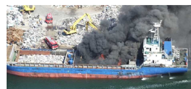
Fire on board the cargo ship TAI YUAN

(For more details, see pages 48~52 of “Feature 2 Summaries of major marine accident investigation reports (case studies)”