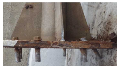
Overturned signal light (inside Shinsapporo Station)

11 railway accidents were subject to investigation, with investigations into the causes of 26 accidents performed, including 15 ongoing accident investigations from the previous year. Further, two railway serious incidents were subject to investigation, with investigations into the causes of three serious incidents performed, including one ongoing serious incident investigation from the previous year.