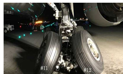
Damage to the right landing gear of a Korean Air plane