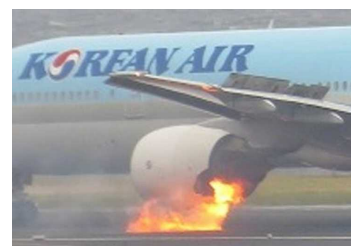
Engine fire on a Korean Air plane

Completed investigation into the causes of accidents, etc. undergo committee (subcommittee) review/resolution, investigation reports are submitted to the Minister of Land, Infrastructure and Transport, and published on the Japan Transport Safety Board website. Major accidents, etc. published on the Japan Transport Safety Board website are as follows.