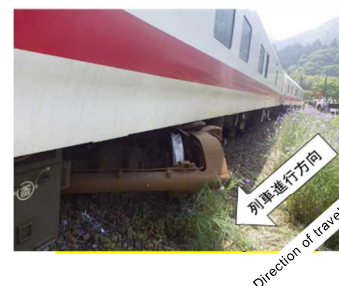
Watarase Keikoku Railway Train derailment

First axle of the front carriage of the second car Left wheel