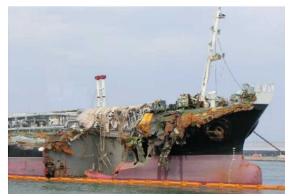
Oil tanker HOUNMARU after contact with a bridge

828 marine accidents were subject to investigation, with investigations into the causes of 1,353