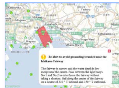
Screen image : safety alert for Ichikawa Waterway