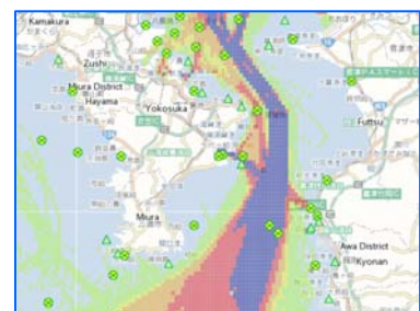
Screen image : vessel traffic density in Uruga Channel