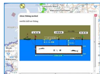
Illustration of typical fishing method in the area