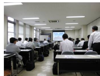
Japan Institute of Navigation, 126th Seminar and Study Meeting, Ocean Engineering Research Group

The following is a list of some of the seminars JTSB lecturers were dispatched in 2012.